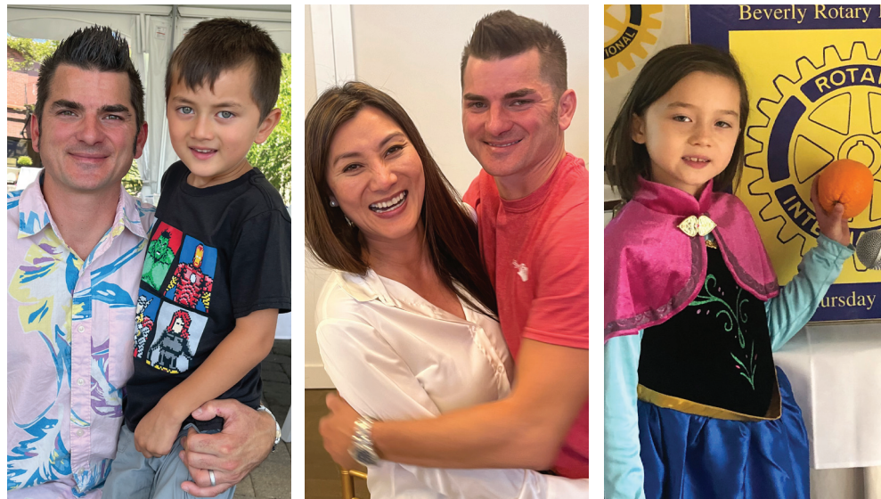
Daddy Day Care Who's your Daddy? Daddy's in trouble in about 8 years